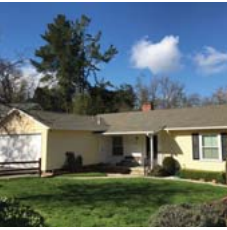
3352 Beechwood Drive, Lafayette

trail and close to downtown Lafayette. of top rated schools.