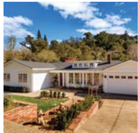
111 Van Ripper Lane, Orinda

Classic 3BD/2BA in the desirable Charming 2BD/1BA on a cul de sac in Newly renovated 4BD/2.5BA retreat Orinda Country Club area up a private the sought after Lafayette Trail area. on lower Van Ripper. Open floor plan, Fabulous starter home or build the indoor/outdoor flow, resort like feel. family room, lawn and views with that house of your dreams. Backs up to the Exquisite craftsmanship. Twelve years